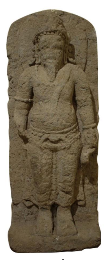
Figure 9: Statue of Agastya Guru

guiding teacher. Thus, it can be proven by the Agastya statue's position in the Prambanan temple, which is in one temple together with the other Śiva s family.