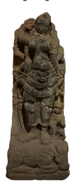
Figure 6: Statue of Durgā Mahiṣāsuramardhinī

replace the elephant head, Batara Gana also changed its name to Batara Mahadewa . It is said that because Umayi Devi turned into Batara Durga , Batara Guru then married Parwati Devi , and from that marriage, Ganesha was born.