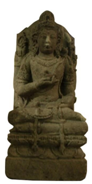
Figure 8: Statue of Viṣṇu – Śakti and Hari Hara