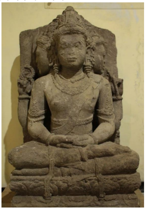
Figure 3: Śiva Triśirah Statue Dieng in Dieng Kailasa Museum, Central Java

statue, there is also a smaller statue but a more fragile/weathered condition. The two front hands appear to be incomplete, and the front and rear of the left face are time-worn.