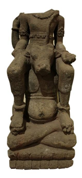
Figure 4: Statue of Nandisavahanamūrti

This statue seemed to leave a message that a devotee must diligently meditate by holding Siva, his idol god, on his shoulders. The whole body supports Siva. Theologically, it can be interpreted that in meditation for a worshiper, the Revered God is not far away but is upheld on the shoulders in the form of divine awareness. This interpretation is what distinguishes the typology of Hindu theology from other religions. Hindus consider God very close. Even the spirit entity must be His servant by upholding Thee.