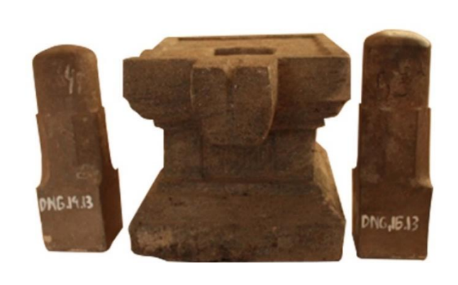
Figure 5: Statue of Śiva Mahadeva, Parvati, and Linga