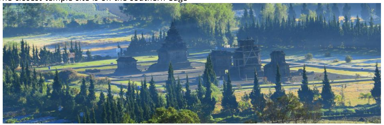
Figure 2: Arjuna Temple Complex

of the valley, the Ghatotkaca temple site, a temple that still exists accompanied by the remains of five other temples. At the northern edge of the valley is the Davaravati temple, again a single temple with the remains of three different temples. Finally, at the foot of the Highlands' southern side is the Bima Temple, which appears to be a single building. While each of the eight temples left in Dieng is the cella , small stones with a single interior space represent various approaches to building type and altar of worship.