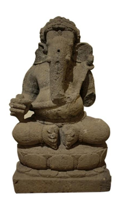
Figure 7: Statue of Ganesha