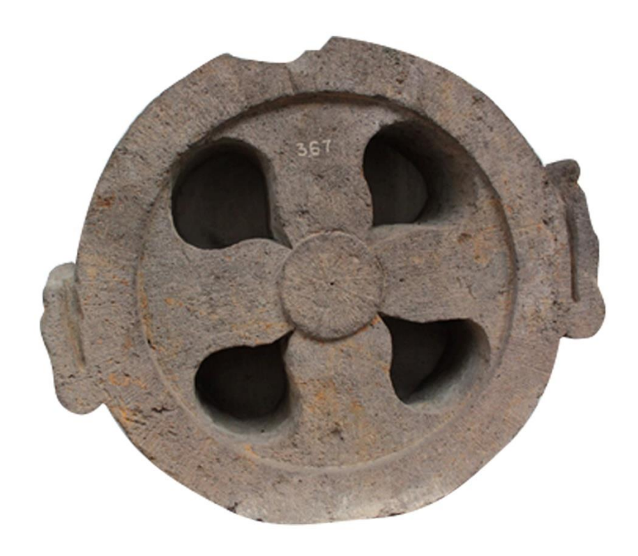
Figure 10: The Wheel of Dharma Statue