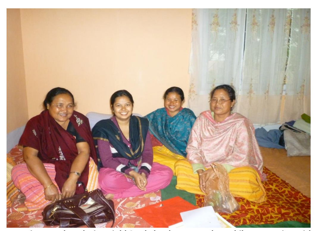
Figure 4: Picture taken during Field Study by the Researcher while Interacting with the Members of the Women's Organisation

men and women while addressing the problems linked to women. In short, the empowerment of women in the region is the central objective of this organisation. Mrs Pramila Rani Brahma, who is currently serving as the Forest Minister, Government of Assam was its first president (Bhuyan, 2008). Thus, the genesis of the organisation can be traced back to the period when the demand for political autonomy for the Bodos mooted by ABSU began in 1980. During this period, it was felt that the Bodo women should not be sidelined in the process as they could play an essential role the overall welfare of the Bodo society. In 1993, the organisation changed its name as ABWWF. The changing of name from AATWWF to ABWWF is mainly because most of the members of the organisation were from the Bodo community.