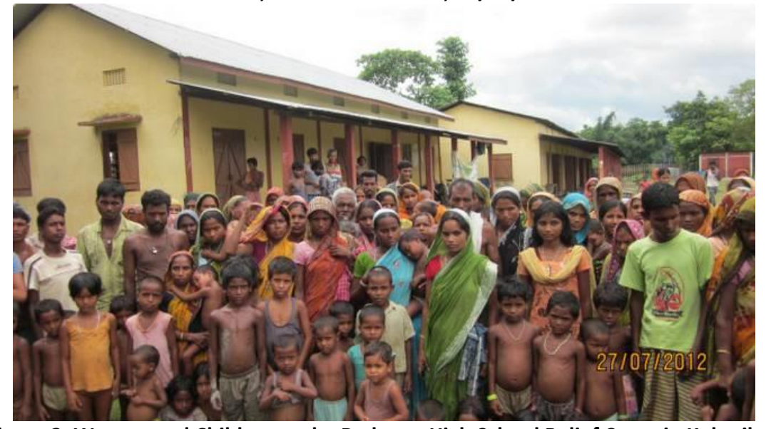
Figure 3. Women and Children at the Badgaon High School Relief Camp in Kokrajhar