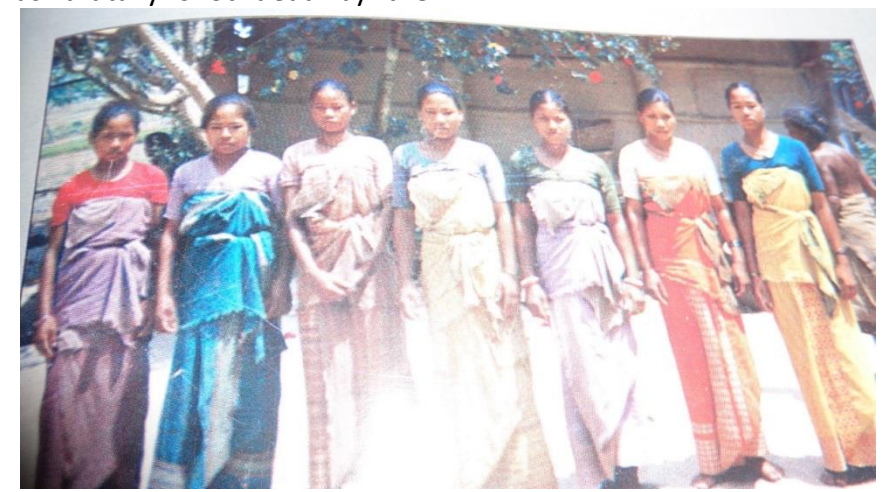
Figure 5: Victims of Bhumka Rape case, Source: Songdan

Assam Police Task Force while she was along with some women, trying to prevent the arrest of eight innocent Bodo villagers by the Assam Police Task Force. During the movement when the policemen and the army personnel entered villages in search of ABSU activists/activities, they often targeted women. In order to protect women from various atrocities, the village women's were advised to stay in groups during any police and army operation. At the same time, they were asked not to hide any incidents of torture. They also helped the victims to receive compensation from the Government. In January 1988, a number of women of Bhumka area were raped (See Figure 5). It was due to the efforts of ABWWF member the victims of Bhumka rape case received the first instalment though they are yet to receive the second one.