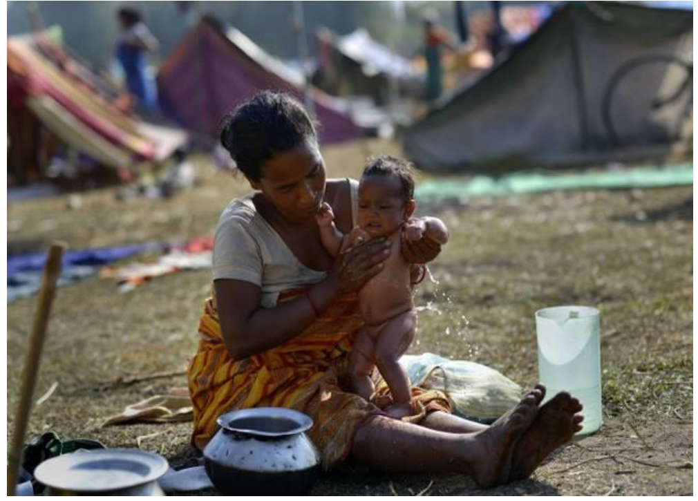
Figure 2: A Bodo Woman with her Newborn Baby at a Relief Camp in Kokrajhar District of Assam

reduced (Rehn and Sirleaf, 2002). Thus, women in the study area have been the worst sufferers. However, despite being victims, there are groups of women in the study area who have been working rigorously both as combatants and as peacemakers towards combating the insurgency. The next section discusses the role of women as combatants.