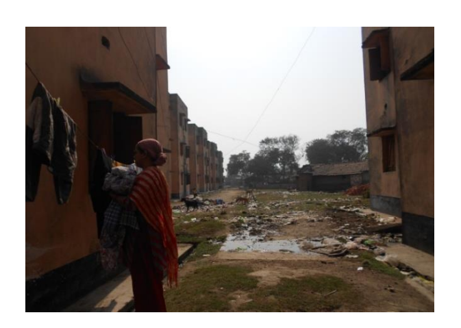
Figure 5: Mismanagement of Waste Disposal at New Town BSUP Colony

Beneficiaries in the rehabilitation colonies are also not satisfied with garbage disposal, privacy and number of rooms. In case of waste disposal, more than sixty families use one dustbin. Removal of garbage is not conducted at regular basis. Drains are filled with garbage which in turn affects the sewerage system (Figures 5 and 6). There are agitations among the people about allotment system of housing units to each resident because it was conducted by