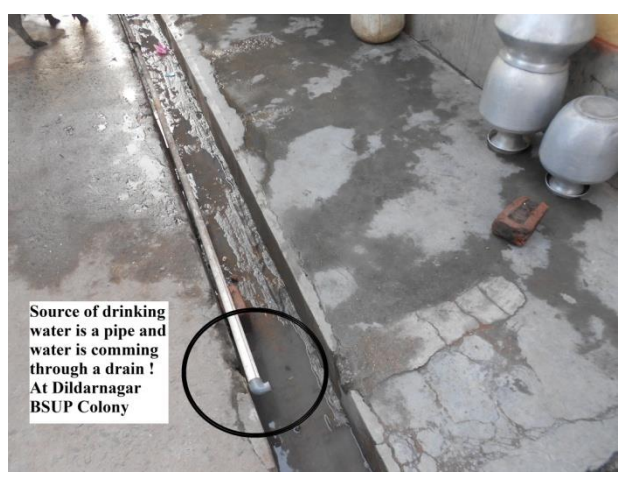
Figure 4: Source of Water at Dildarnagar (Water comes through drain by pipeline in Dildarnagar BSUP Sweeper Colony)

is relatively in a good position. This colony (ward number 24), which is a newly allotted colony and not very far from AMC, has been found to be in a better position. Here, people get water relatively at regular intervals and wastes are disposed at a gap of 45 to 55 days (Figures 5 and 6).