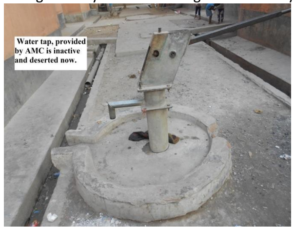
Figure 3: Source of Water at Dildarnagar (Inactive Tap) (Courtesy: Author, 7th February 2016)

Around New Town BSUP colony, there is a large area dominated by slums. Provision of basic services and maintenance is almost forgotten by AMC. Beldanga BSUP colony