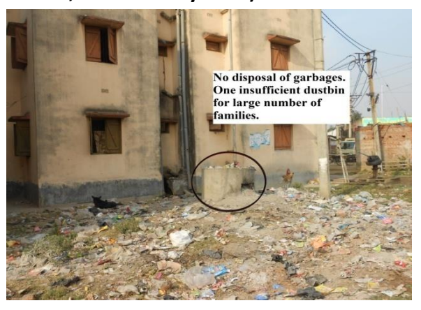
Figure 6: Mismanagement of Waste Disposal at Dildarnagar BSUP Colony (Courtesy: Author, 6th January 2016)

lottery and there are good proportion of dwellers who wished to get a house near their earlier living and working place. Because of the lottery system of housing distribution, many poor people are forced to relinquish their livelihood as they have been allotted a house far distance from their earlier set-up. There are also school students who are facing many problems in going to the schools as the schools are now far away from their earlier location. These