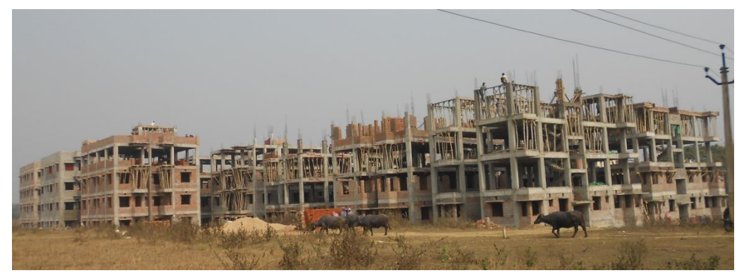
Figure 2: Housing Project Under Construction Low-cost Multi-storied Housing Units under Constructions near Kalyanpur, Asansol (12th January 2016) [Courtesy: Author].

Source: Asansol Municipal Corporation, 2015