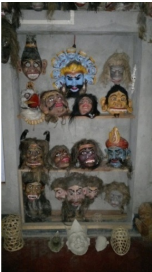
Figure 2: Masks in Samaguri Satra

find the craft of mask making (See Fig-2); and in the Kamalabari Satra , the finest boats are made.