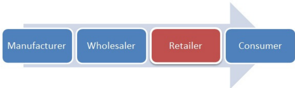
Figure 1: A simple supply chain

and are in direct interface with consumers. 4 At the front-end, retailers directly sell goods or services to consumers. However, at the back-end, they are involved in procuring (also called sourcing), storing, and transporting products that they retail. In many cases, they are involved in processing and packaging as well. The logistics of retailing primarily depends on transportation, communication, and storage infrastructure. 5 Well-developed infrastructure helps improve logistics and leads to efficiency gain in retailing.