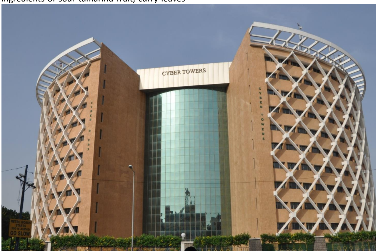
Figure 3: Cyber Towers – Symbolising Cyberabad – The IT Hub

All meals were served on the floor where dastarkhan (white cloth spread over carpet for traditional meal) were spread, but knives, forks, spoons, glasses or napkins, considered essential to the enjoyment of a meal by the Europeans, were never used. Dastarkhan of both Hindus and Muslims had great importance, with a variety of food in the day-to-day life of the people of the Hyderabad. It was part of the social life of the people, who were known for their hospitality. This was a mark of the magnificent Deccani culture. Whether poor or rich, all were equal in showing hospitality.