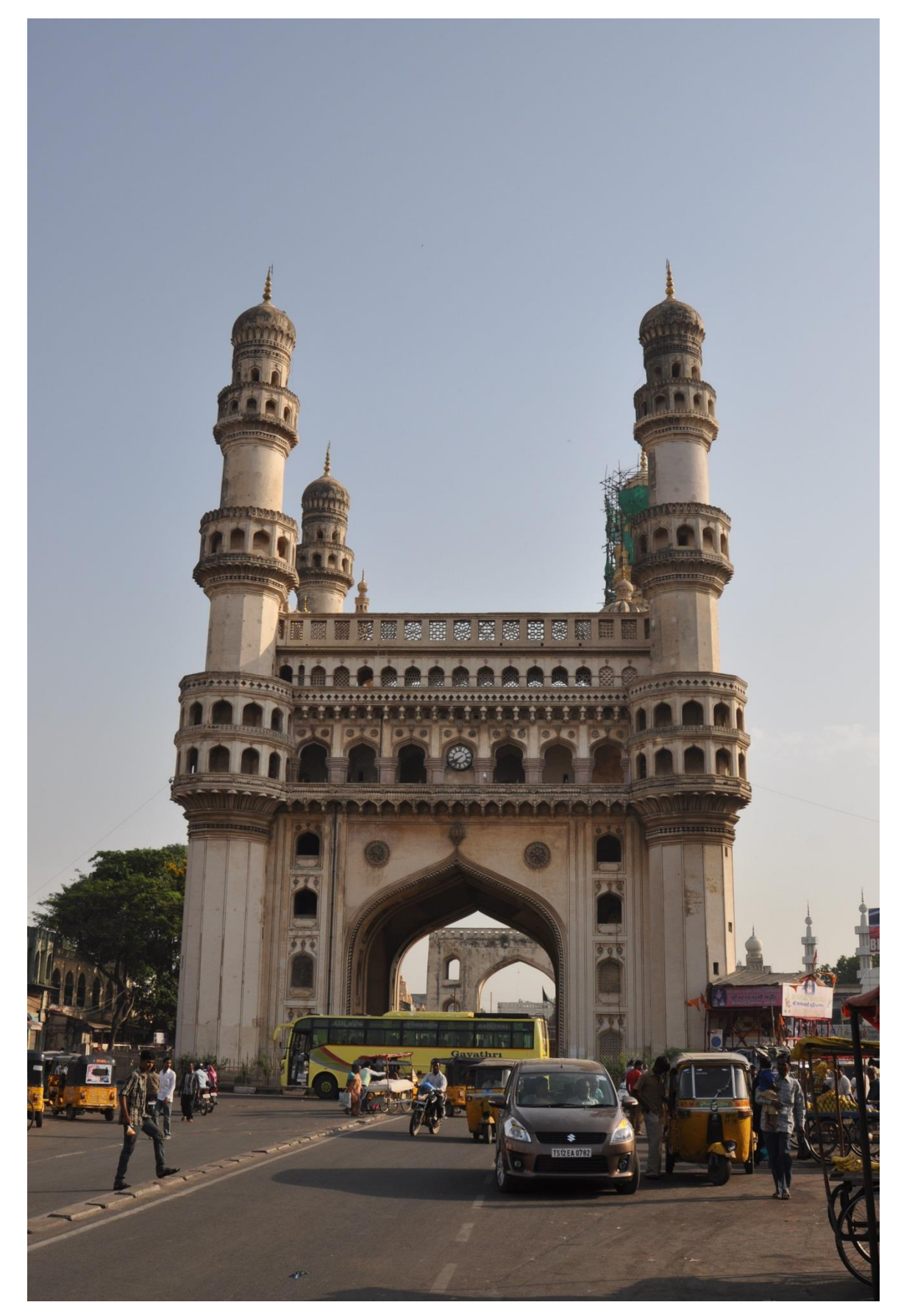
Figure 2 Charminar – Symbolic of Hyderabad and an Architectural Marvel