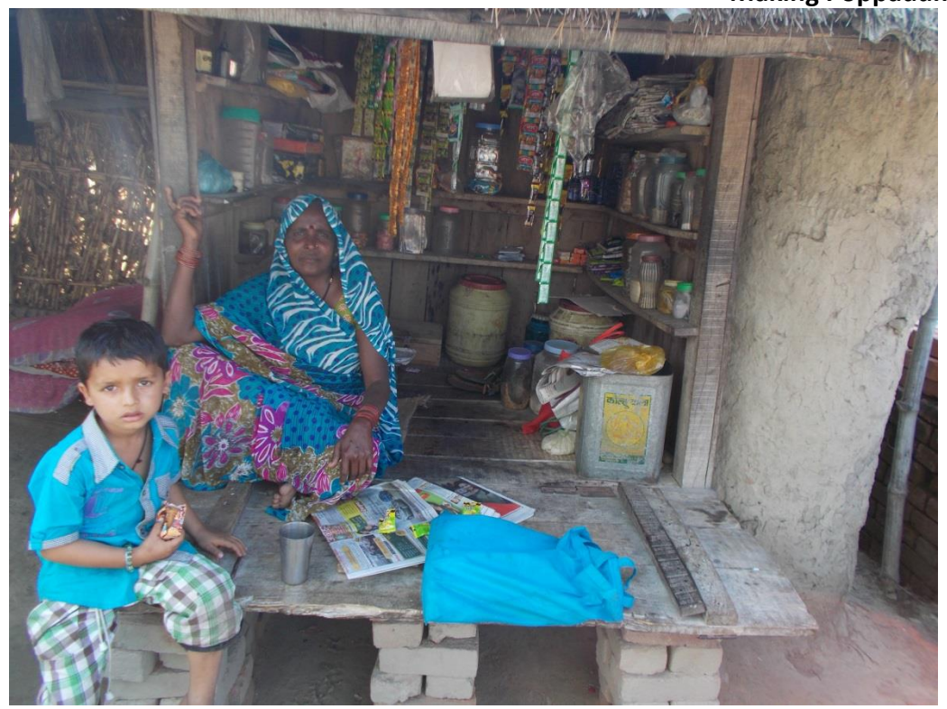
Figure 5: Woman Working in Her Petty Shop