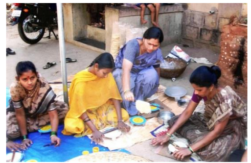
Figure 4: Women Collectively Making Poppadum