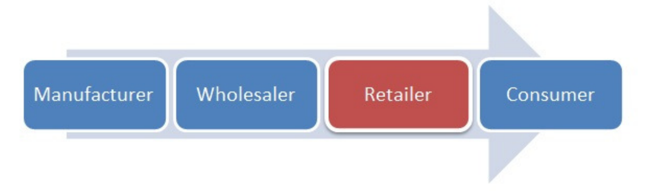
Figure 1: A simple supply chain

and are in direct interface with consumers.<sup>4</sup> At the front-end, retailers directly sell goods or services to consumers. However, at the backend, they are involved in procuring (also called sourcing), storing, and transporting products that they retail. In many cases, they are involved in processing and packaging as well. The logistics of retailing primarily depends on transportation, communication, and storage infrastructure.<sup>5</sup> Well-developed infrastructure helps improve logistics and leads to efficiency gain in retailing.